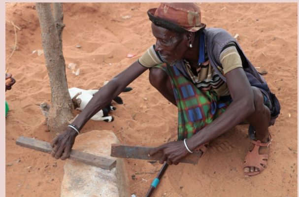
Figure 2: A blacksmith at work

gathers, women enterprises such as making of calabashes, tools of work and weapons for community protection. Some of the tools are also used to predict the future and are able to prepare for these events such as war, rains and drought as a community.