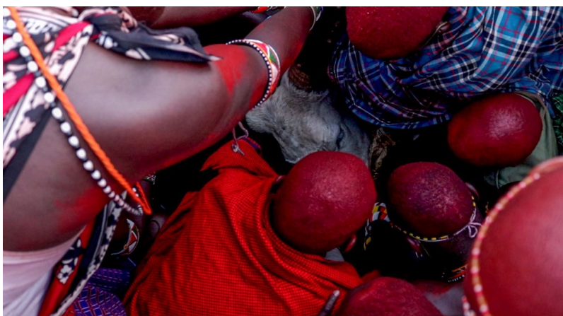
Figure 1: Shows official suffocation of the cow for blessings and blood taking.

the COVID-19 pandemic where all measures had to be taken and one of them was to reduce the event to a one-month period. MCH/IMPACT attended the 5-day cultural manyatta ceremony with the main aim of documenting the procedures, traditional cultural expression and knowledge with information that would be passed from one generation to another.