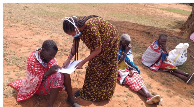
Figure 1: A staff taking records during distribution