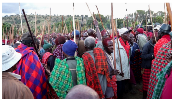
Figure 2: Shows elders blessing the youth.

MCH/IMPACT managed to mobilize elders for a dialogue meeting with the administration to allow the event to take place within a shorter period taking into consideration all the COVID-19 precautions.