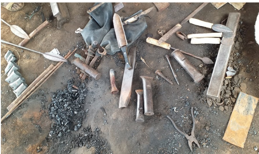
Figure 2: Some tools used and made by the Ilkunono

To find the link to the Blacksmith (Il Kunono) documentary, click here .